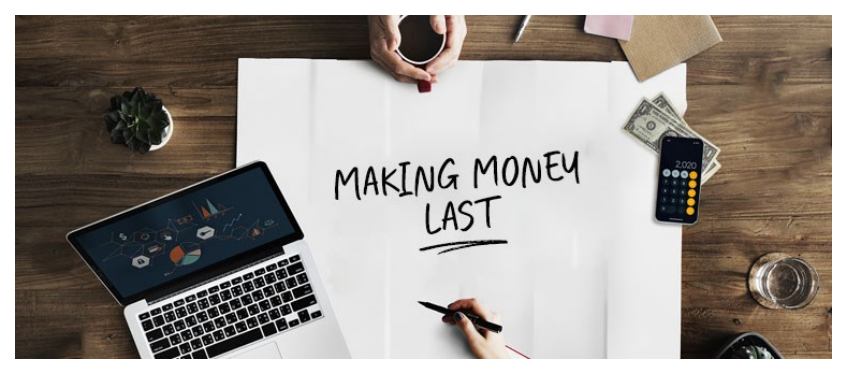
God's Financial Laws of Elimination February 13-14, 2021